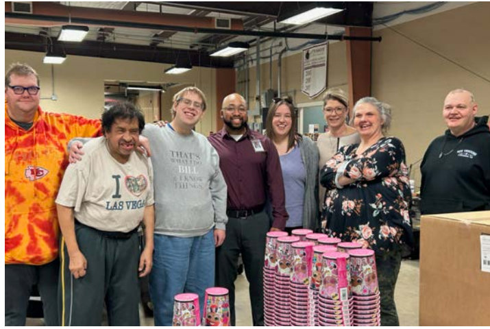
Lawrence Douglas County Public Health Department