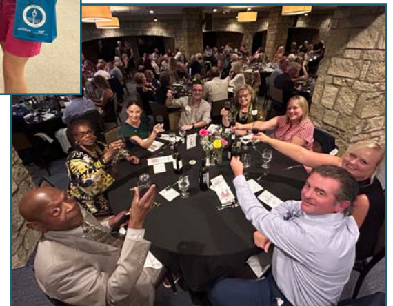
Grand Tasting/Auctions Saturday, July 13th