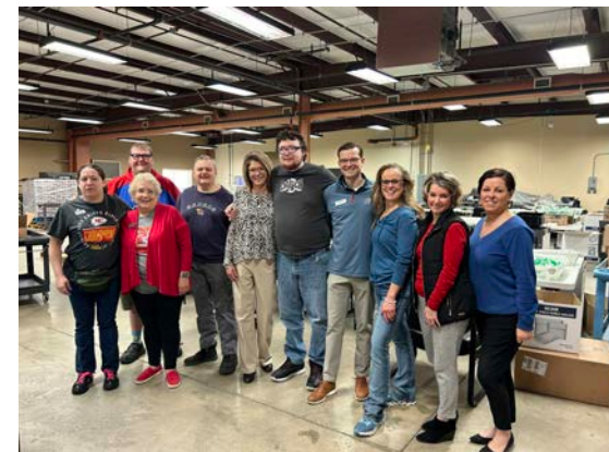
Lawrence Schools Foundation