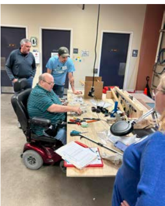
City Lifestyle Magazine