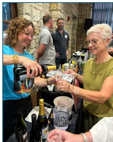
Winemaker Dinner Friday, July 12th