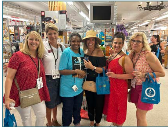
Mass St.Mosey Thursday, July 11th