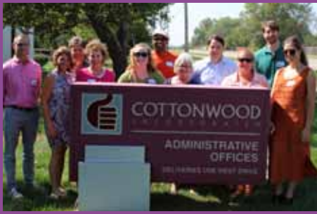
Stephens Real Estate