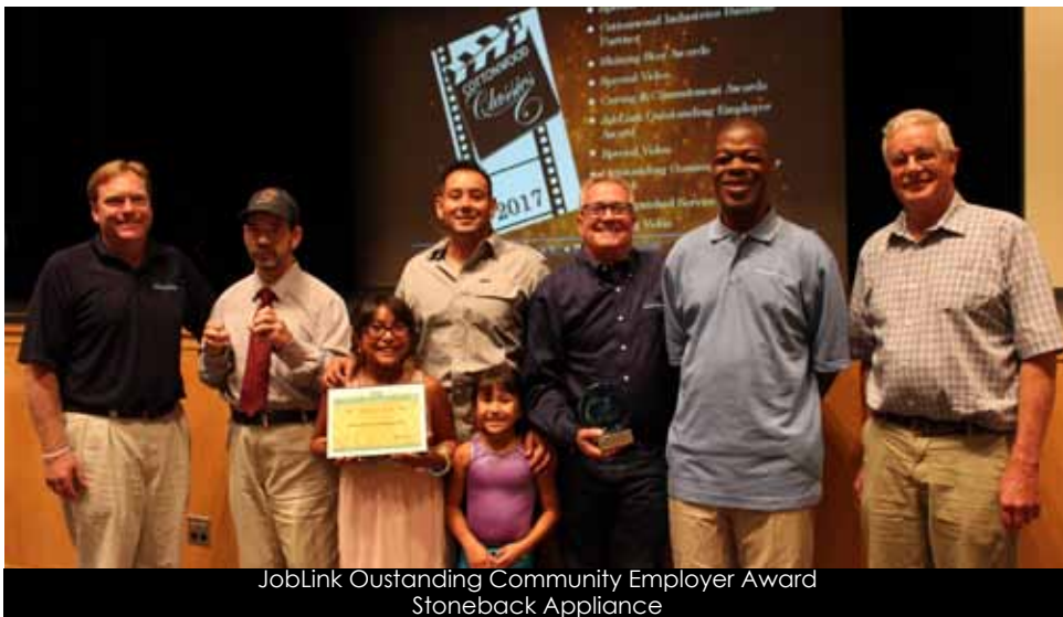
JobLink Outstanding Community Employer Award Stoneback Appliance