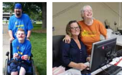
We love our DSPs!