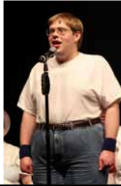
The Cottonwood Choir started out the evening with songs from the 80's.