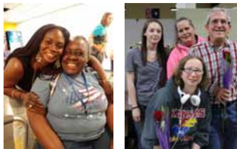
Thanks for all you do!