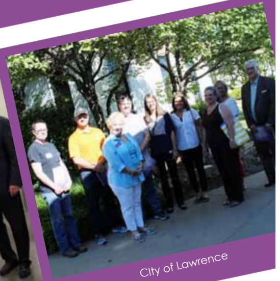
City of Lawrence