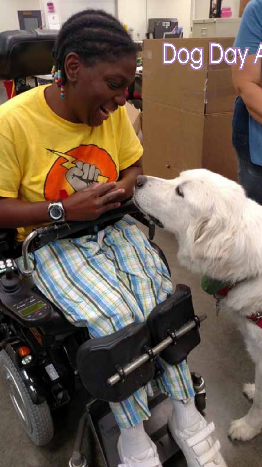
Dog Day Afternoon