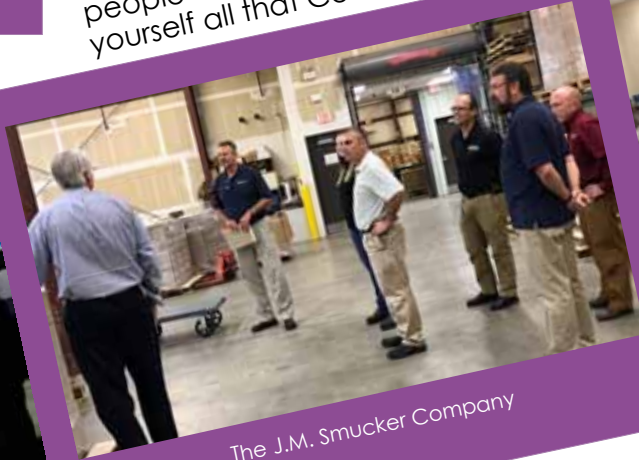
The J.M. Smucker Company