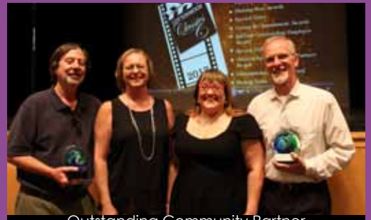
Outstanding Community Partner Lawrence Transit/MV Transportation