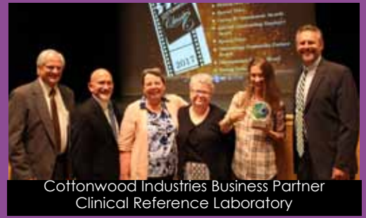
Cottonwood Industries Business Partner Clinical Reference Laboratory