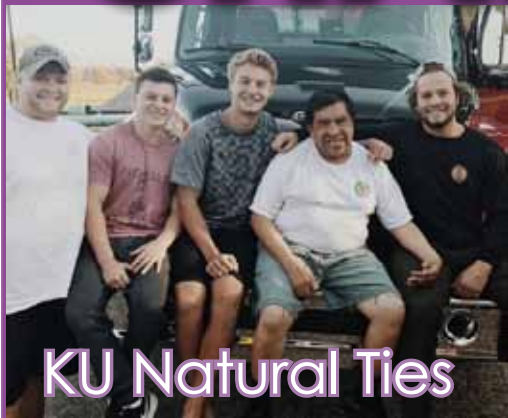
KU Natural Ties