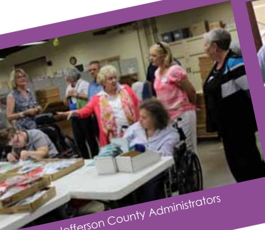
Jefferson County Administrators

We are very proud of the work that is done at Cottonwood to support people with intellectual and developmental disabilities. Come see for yourself all that Cottonwood does.