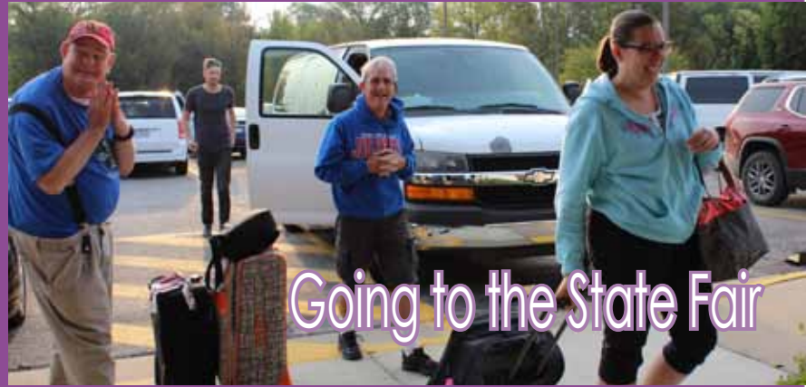
Going to the State Fair