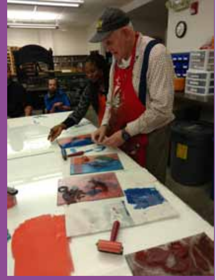
Life Enrichment Art Show