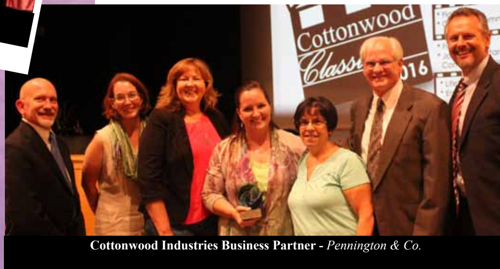
Cottonwood Industries Business Partner - Pennington & Co.