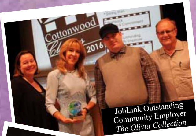
JobLink Outstanding Community Employer The Olivia Collection