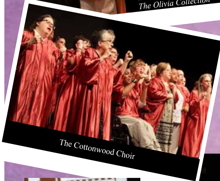
The Cottonwood Choir