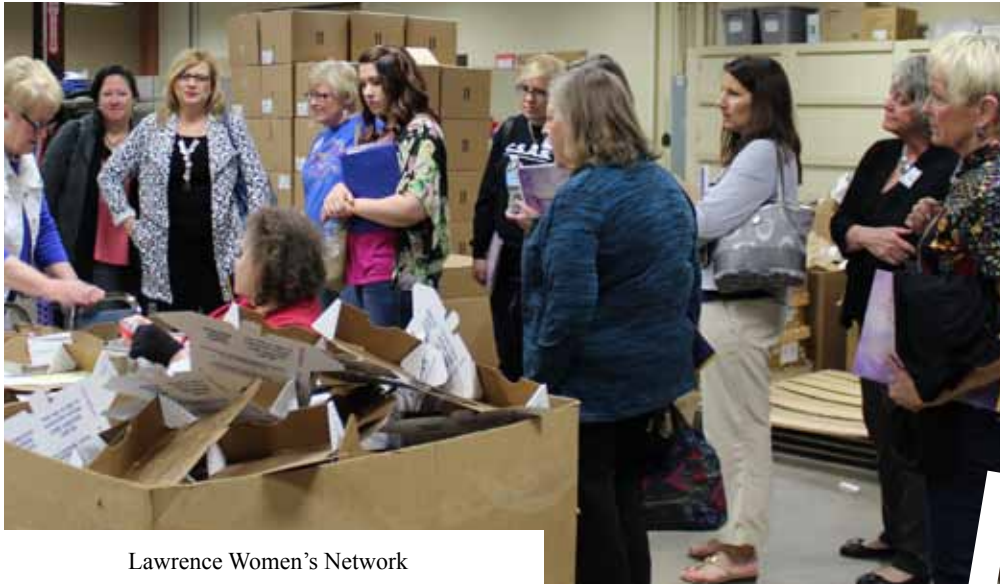
Lawrence Women's Network