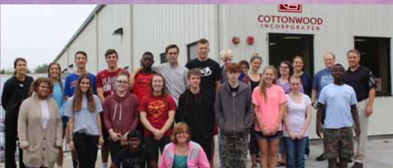
Lawrence High School Interpersonal Skills Class (IPS)