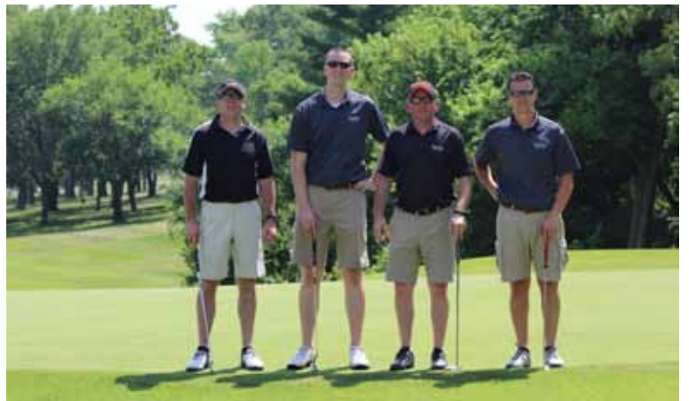
Maybe Next Year Flight Winners Truity Credit Union